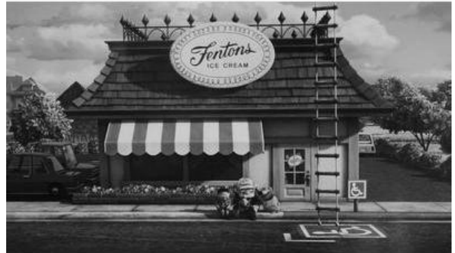
Fentons Immortalized By Pixar!

sult the activity calendar for more information, including dates and times.